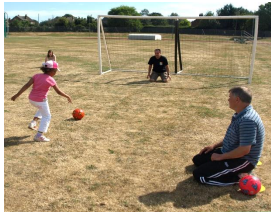
Everyone gets a chance to practice their footie skills!

We are always pleased to receive feedback from our events and one parent wrote: "I just wanted to thank you for organizing the day yesterday. It was lovely and we met some lovely people who we've arranged to meet again. I look forward to future events." Job done!