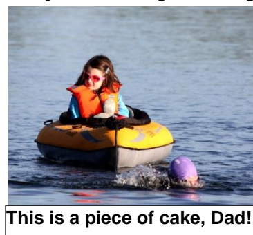
This is a piece of cake, Dad!